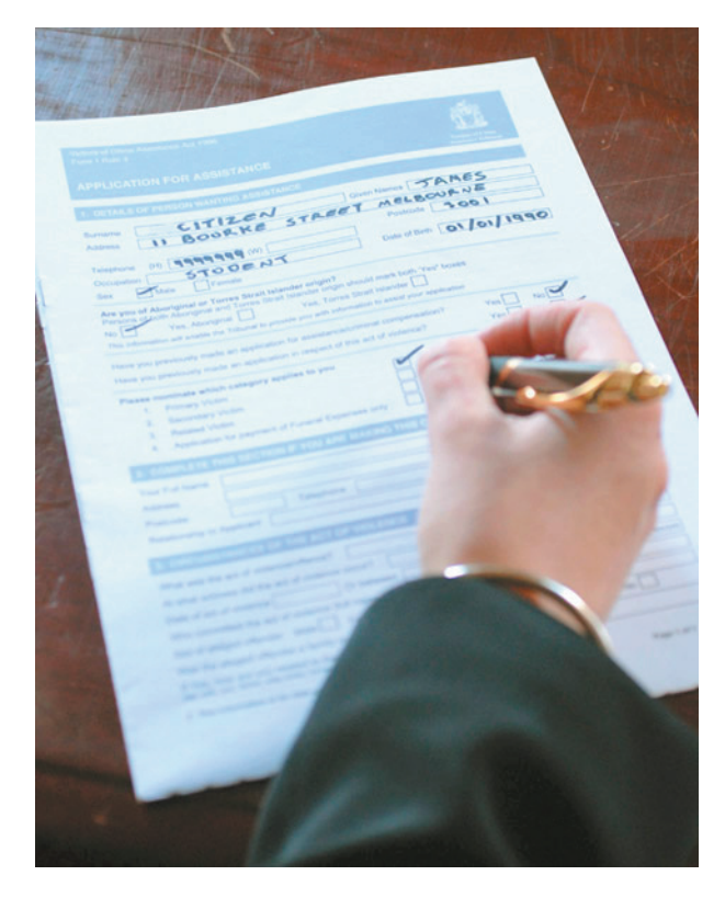
Tribunal's application form.

An application to the Tribunal must be lodged with or posted to a registrar of the Tribunal at the venue of the Tribunal that is closest to the applicant's place